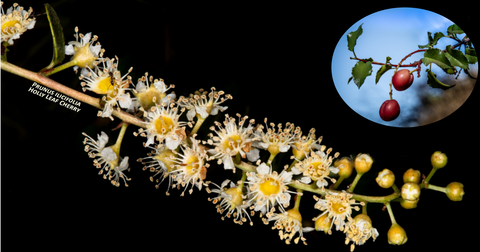
PRUNUS ILICIFOLIA HOLLY LEAF CHERRY