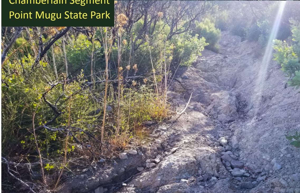
Backbone Trail - Chamberlain Segment Point Mugu State Park

Several Saturdays and hikes up to 5 miles & 2,300 feet elevation gain. We cleared brush and repaired tread over a 5 mile stretch of the Backbone Trail. This segment looked like a stream bed before we began working on it. Amazing, what a group of dedicated volunteers can do!