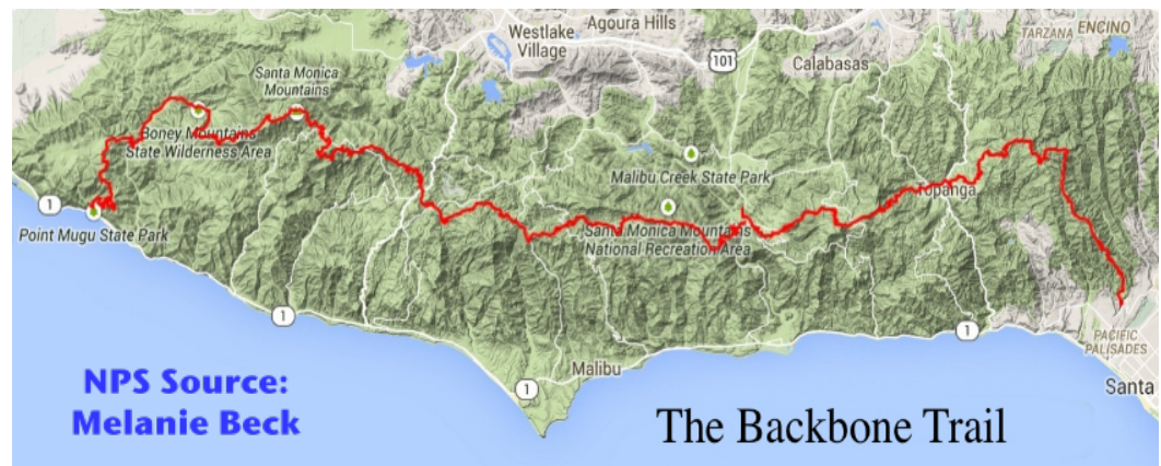
The Backbone Trail

"PEOPLE WALK ALL OVER MY BEST WORK." - RON WEBSTER